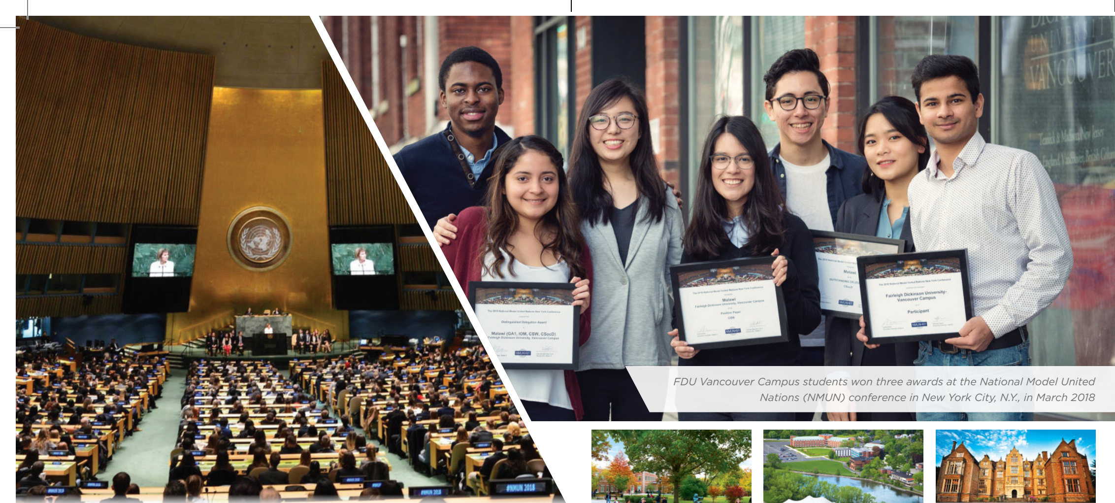
FDU Vancouver Campus students won three awards at the National Model United Nations (NMUN) conference in New York City, N.Y., in March 2018