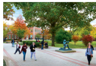
FLORHAM CAMPUS NEW JERSEY