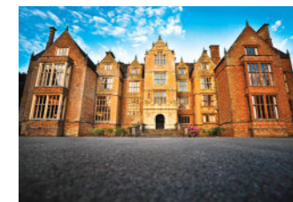
WROXTON COLLEGE ENGLAND

SEAMLESS VISITING SEMESTERS AT FDU CAMPUSES IN THE U.S. AND U.K.