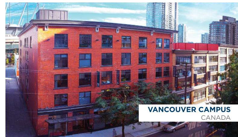
VANCOUVER CAMPUS CANADA

SEAMLESS VISITING SEMESTERS AT FDU CAMPUSES IN THE U.S. AND U.K.