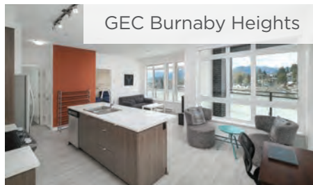
GEC Burnaby Heights