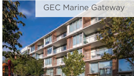
GEC Marine Gateway