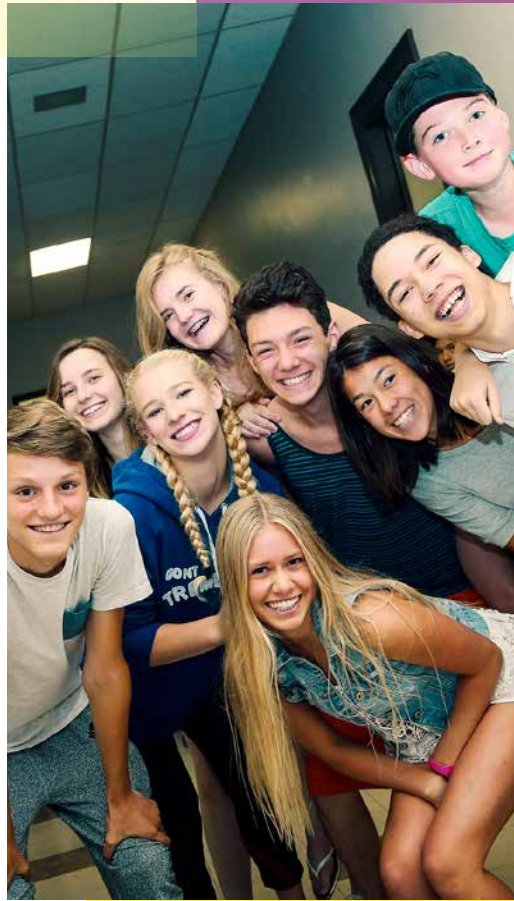
Hooray for friendship!