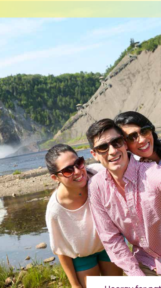
Hooray for nature!