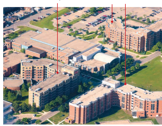
On-campus student residences

NOTE: accommodation fees are subject to change. Questions: fanshawecares@fanshawec.ca