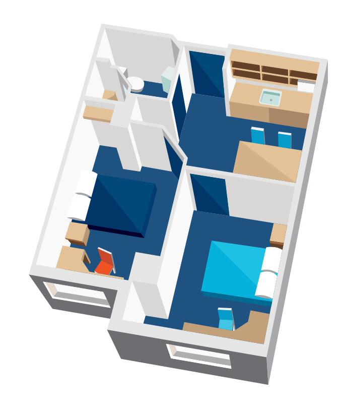
*This rendering is only an approximation of your living space in residence.